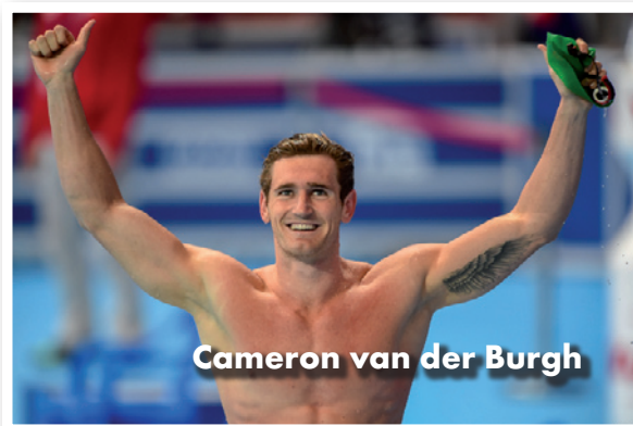
Cameron van der Burgh