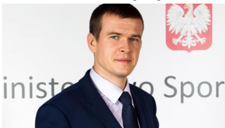
Minister of sport – Witold Bańka

Competitions will be held under honorary patronage: