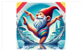
FIGURE RESULTS - GNOMES A

5th International Competition in Artistic Swimming WROCLAW / 28.2.-2.3.2025